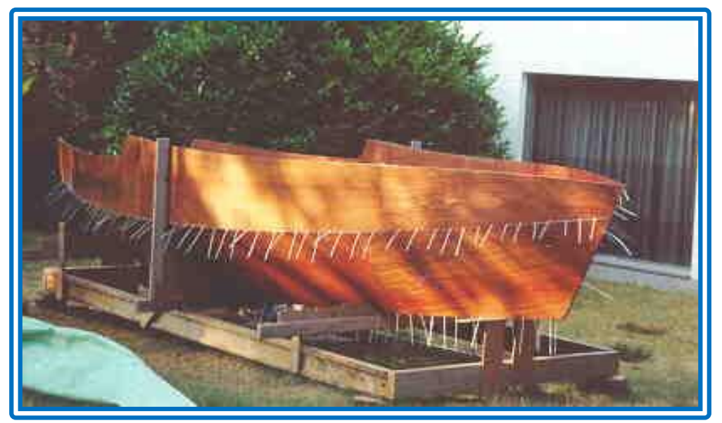
A Serpentaire hull with very visible stitches