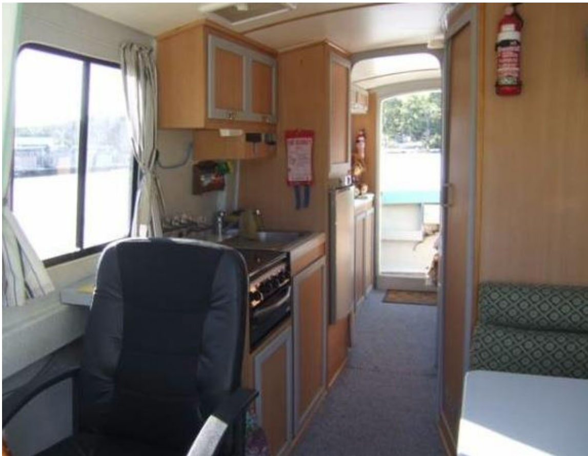
Some pictures show modifications made by the builder

The galley across the dinette has ample room for a stove with oven, wide sink, fridge and more. Forward of the galley, one could install a wood stove or diesel heater for winter cruises.