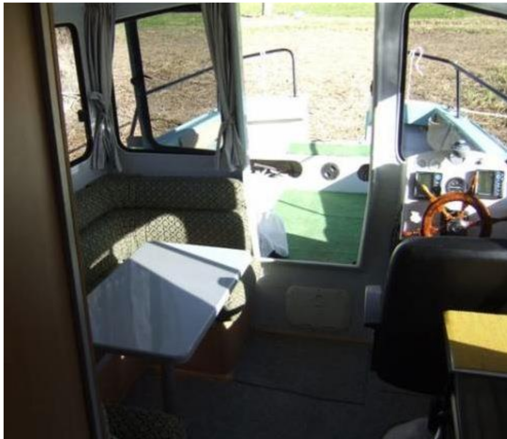
Some pictures show modifications made by the builder

The layout of the forward cabin (or sun room?) can be adapted to your preferences. We show an open layout with a standard futon. A patio table and chairs for 4 fit on the opposite side and can also be moved to the forward cockpit.