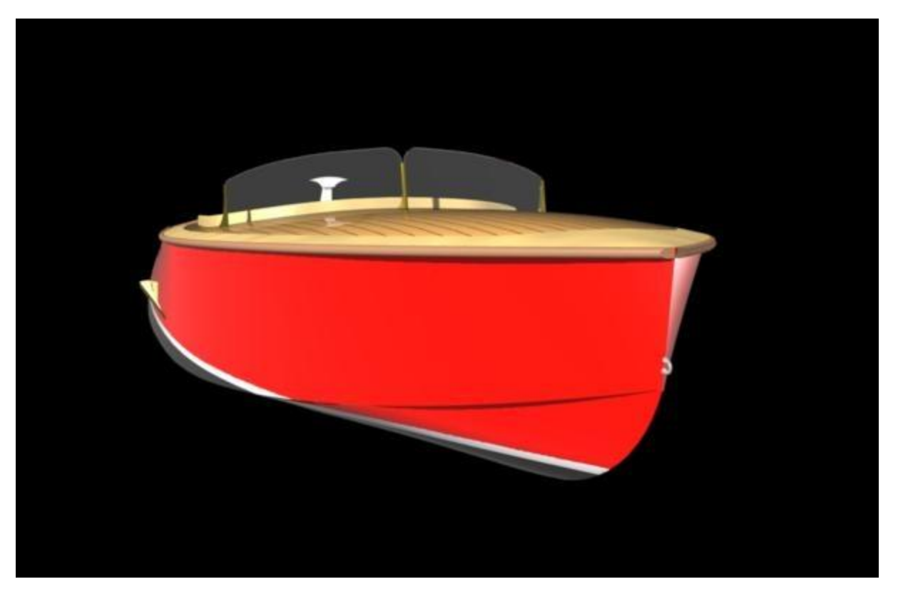
It's an old fashioned vee hull that ends up with a flat transom: fast but not designed for anything else than good weather