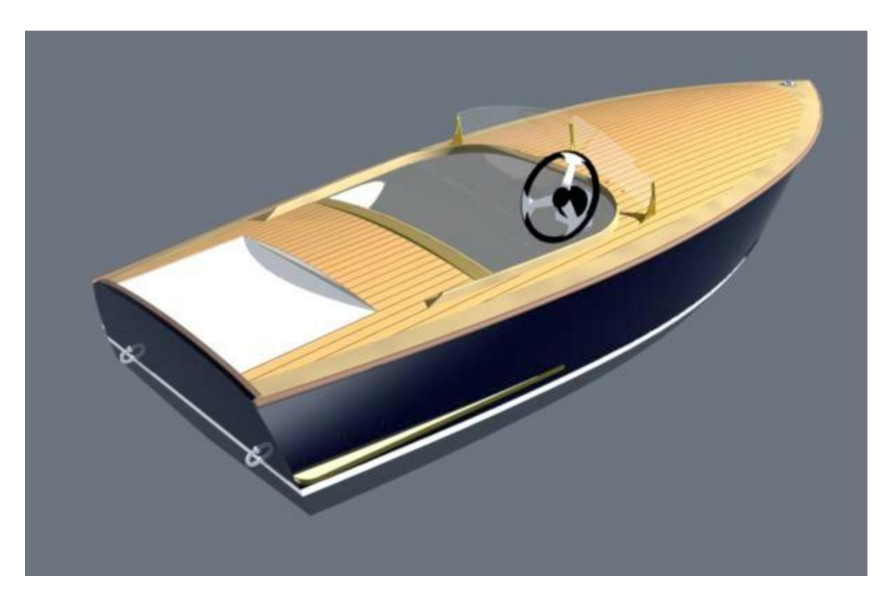
The RB12 is not a racer. She is designed to cruise around at a good speed with minimal HP. Built light and with one person on board, she will plane with a 10 HP but will feel better with a 25.